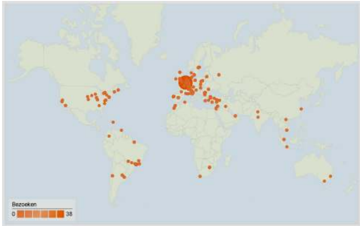
Figure 2: the geographical distribution of unique visitors in September 2008 for www.driver-repository.be

Another element of the analytics software shows where the visitors are located geographically: most visitors come from Belgium (120) and the neighbouring countries (40), as well as the rest from Europe. Some extra visitors come from the US (East and West coast, which can be accounted for through their high concentration of repositories), South-America and South-Africa and Asia. The figure shows that the targeted group (Belgian DRIVER community) finds its way to the website, and the wider repository community also visits the site on a less frequent basis.